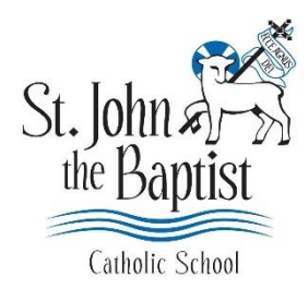
January 12, 2023